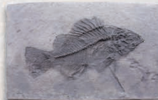
Fish Skeleton Size: 12 x 9 inches