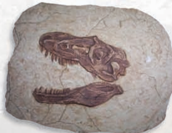
Albertosaurus Skull Size: 17 x 14 inches