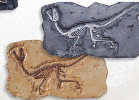
Raptor Skeleton Size: 52 x 29 inches