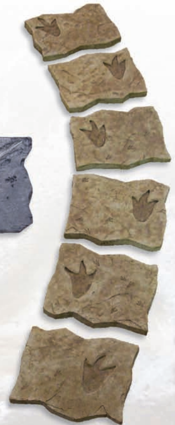
Interlocking Trackway Size: 24 x 20 inches (each panel)