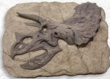
Triceratops Skull Size: 44 x 34 inches