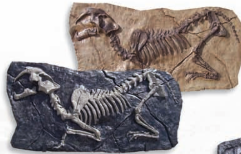
Sabretooth Cat Size: 60 x 30 inches