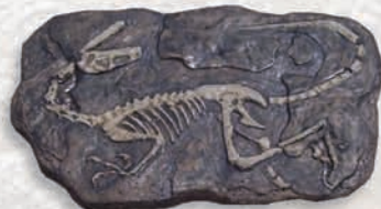
Death Pose Raptor Size: 37 x 23 inches