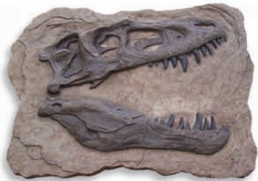
Tyranosaur Skull Size: 46 x 37 inches