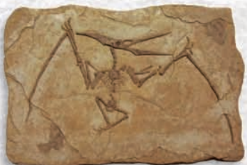
Pterosaur Skeleton Size: 45 x 30 inches