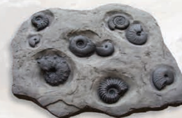
Ammonite Shells Size: 16 x 12 inches