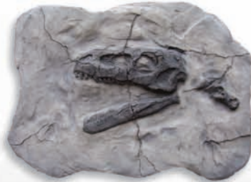
Raptor Skull Size: 15 x 11 inches